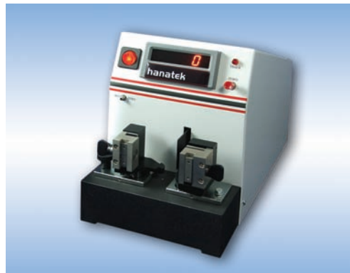
CBT 1 Crease and Board stiffness tester

Profiles the crease forces present during carton converting. Also measures carton opening force and board stiffness.