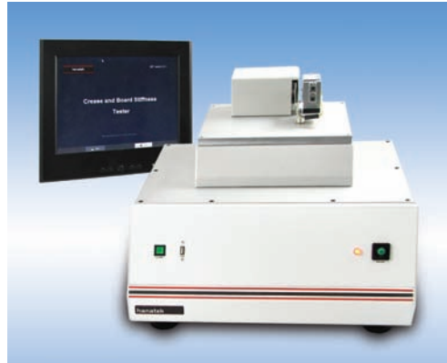
CBT 3 Advanced Crease and Board stiffness tester