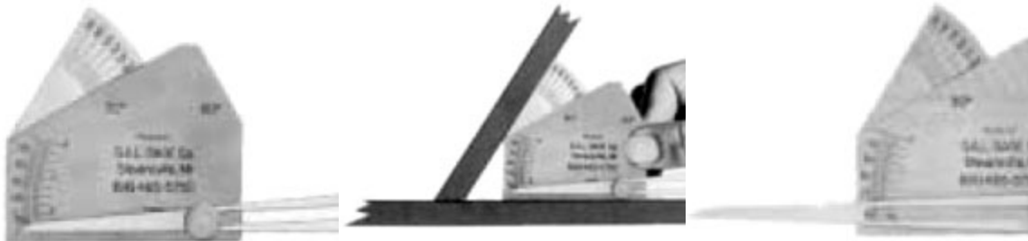
Gauge with Pointer Retracted

Replaces all other sets of gauges to measure fillet or groove welds in skewed members or members at 90 degrees.