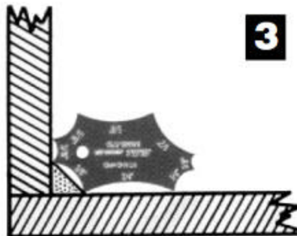
Measures Leg Length