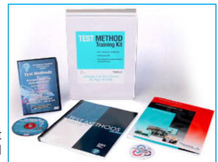
PSTC Testing Kit TLMI Testing Manual