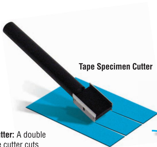
Tape Specimen Cutter

Tape Specimen Cutter: A double razor blade sample cutter cuts samples to a precise 1 inch width. Other sizes available.