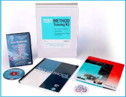
PSTC Testing Kit TLMI Testing Manual