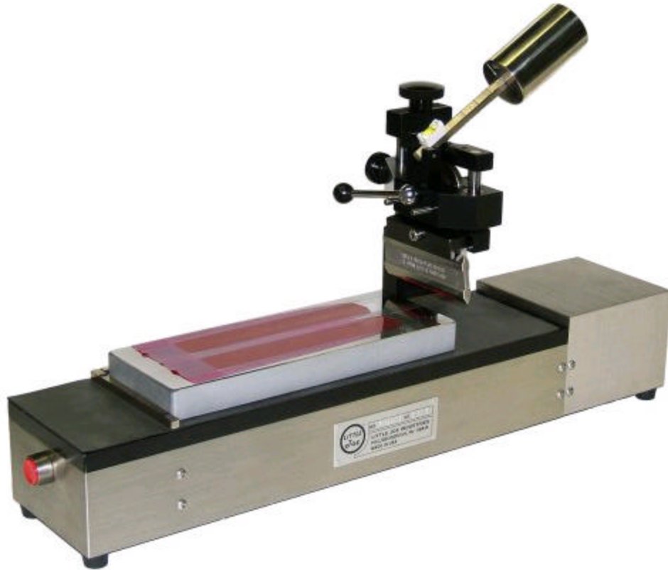
"Little Joe" ADM-1 Automatic Draw Down Machine