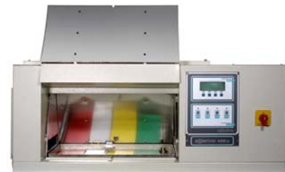
Vertical and Horizontal Salt spray chambers, 8 Models Full range of options for continuous and cycling test.